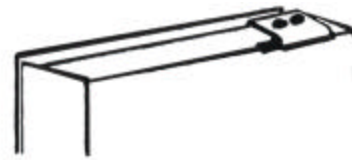
A. 400 SHELF MOUNTING