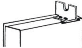
B. KTJ MOUNTING